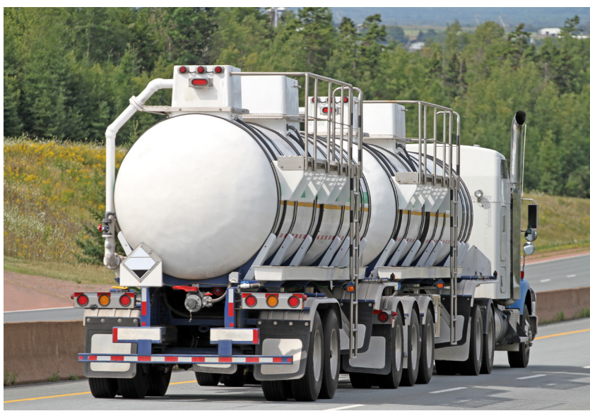
Chlor-Alkali: State of the Market in 2020 9

Dixon has provided the chemical processing industry with reliable, high-quality connections for various chemical needs for decades, and the chlor-alkali industry is no exception. Dixon's angle valve for chlorine rail cars has been trusted on North American railways for more than 15 years making it an ideal choice for the industry. Its bellows sealed valve helps eliminate unwanted emissions, preventing waste and harmful atmospheric conditions.